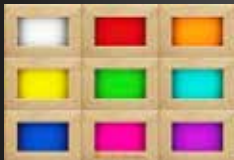
Oversized Interior Reading/Chromotherapy Lighting System

Pro 6 Saunas bring healthy living and longevity to the privacy of your home. Our innovative Carbon Tech Heat Emitter Panels are engineered to produce a wider, softer heat that is evenly distributed throughout the sauna. Our P6 Series Sauna models are constructed using Reforested Canadian Hemlock Wood and come in 1, 2, & 3 person capacities. These sauna models come with standard features such as Carbon Tech Low EMF Heat Emitter Panels, Dual Control Panels on most models (single Control Panel on P6-H356-01), Floor Heater, Exterior Ambient Lighting, FM/CD Player, Privacy Bronze Tempered Glass, Roof Vent, and more.