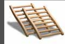
Optional Backrests (sold in pairs)